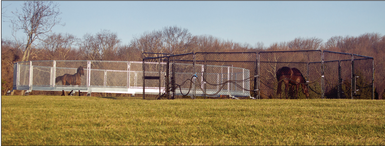
Our round pens are equipped with hydraulics and wheels, allowing them to be moved daily.