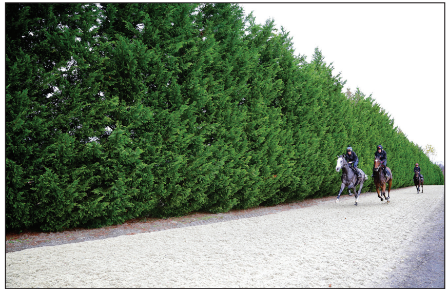
The New Tapeta 10 on the main all-weather track.