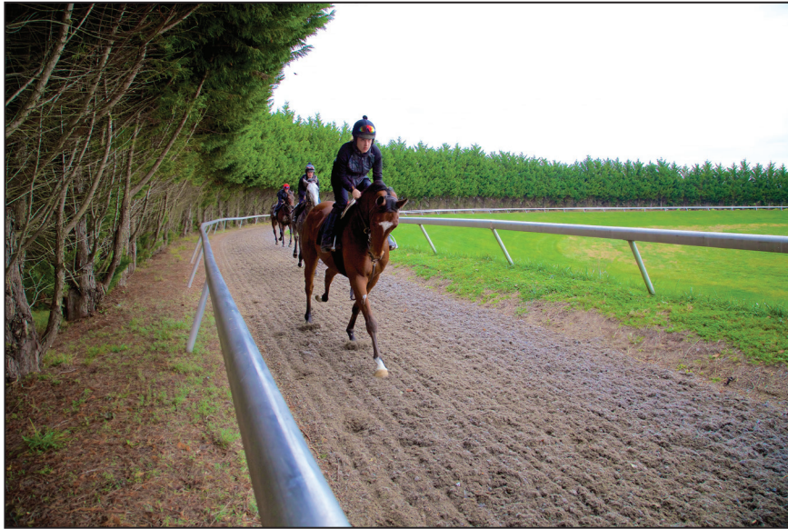
On the warm up track - every Monday, Wednesday, and Friday we canter left handed.