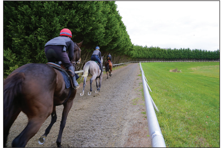
On the warm up track - every Tuesday, Thursday and Saturday we canter right handed.