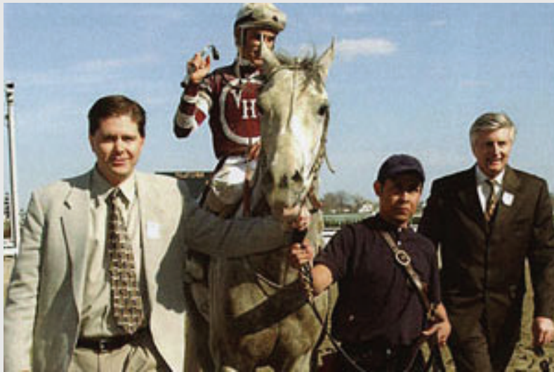
Tapit after winning the Wood Memorial Grade 1 in New York.