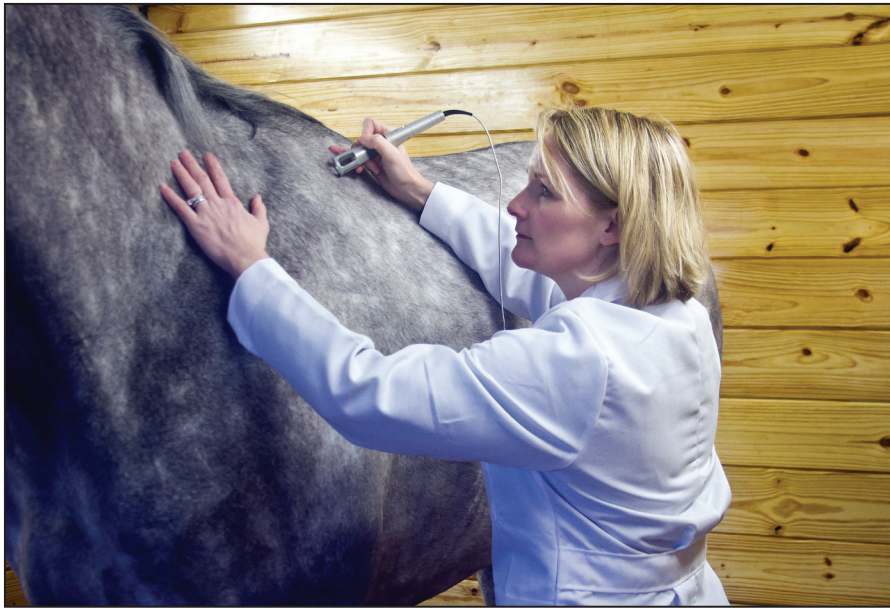
At Tapeta Farm our highly trained staff can coordinate and administer the available treatments to increase performance of our racehorses.