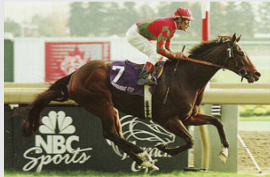
Da Hoss winning the first of his two Breeder's Cup Mile races.