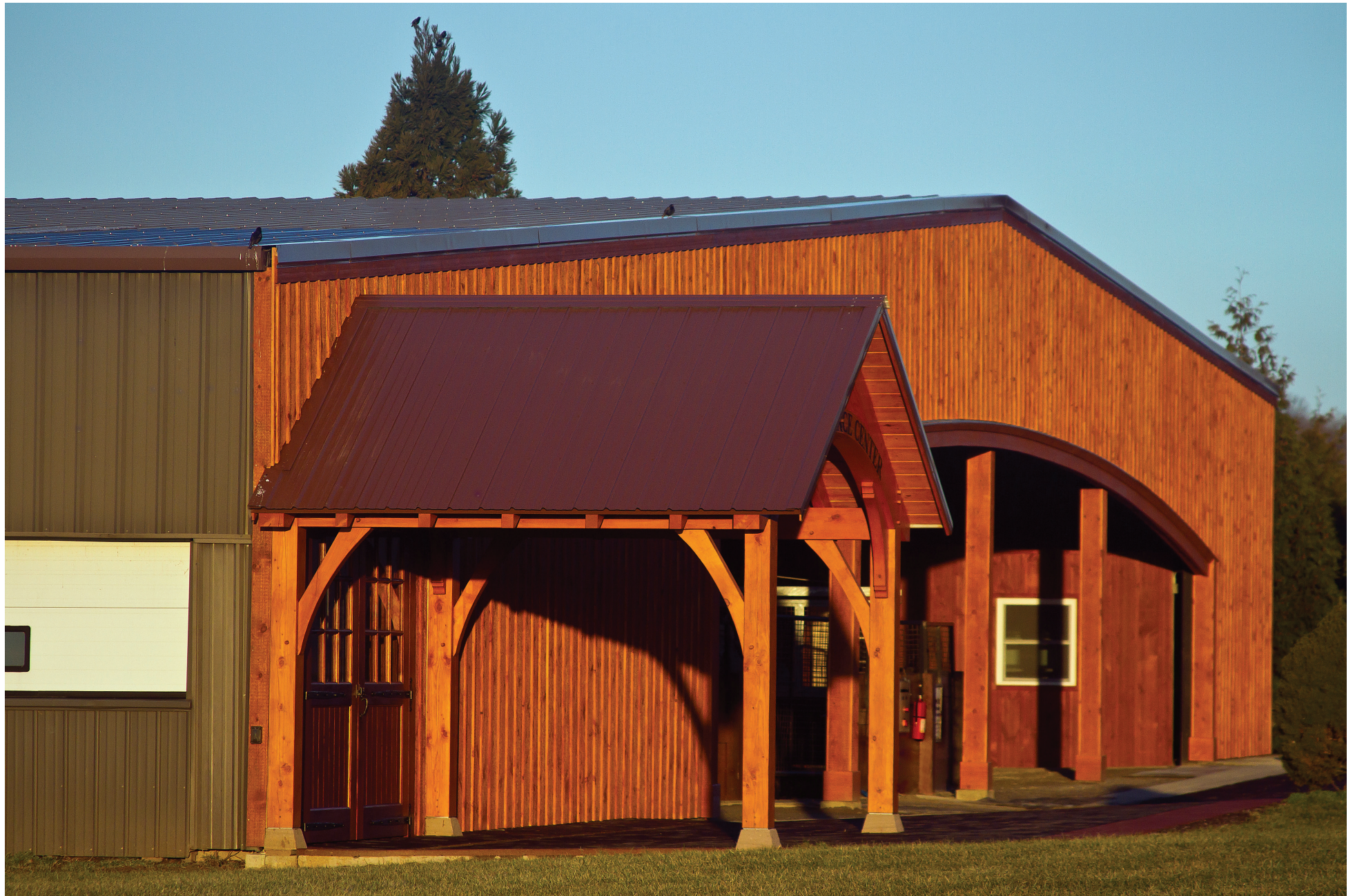
The Performance Center