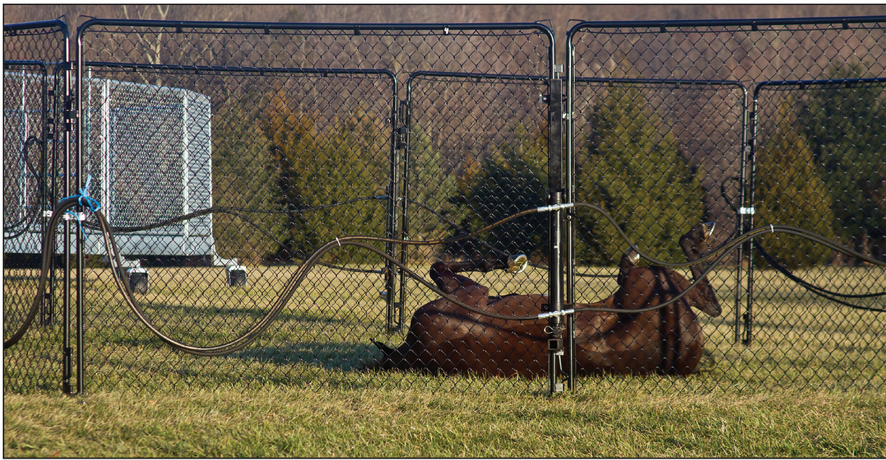
Above we see a horse rolling in the pen enjoying the fresh air and grass.