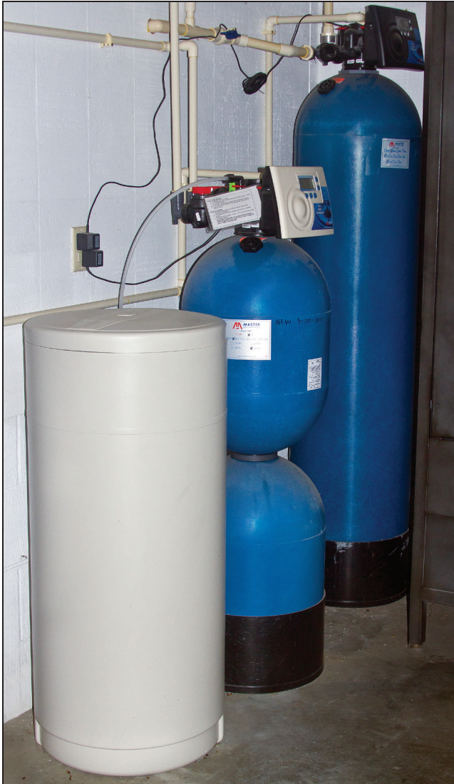
The water treatment system at Tapeta Farm filters the well water, balances the pH and enriches the water with any minerals needed.

The Cold Saltwater Spa reduces inflammation after workouts.